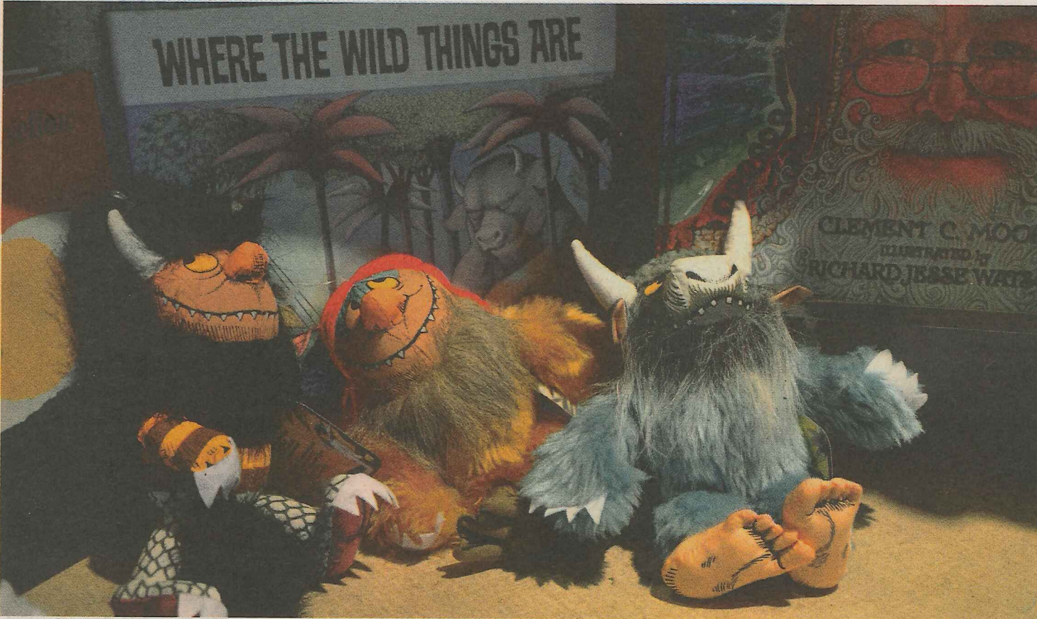
Wild things lurk in Now and Then.